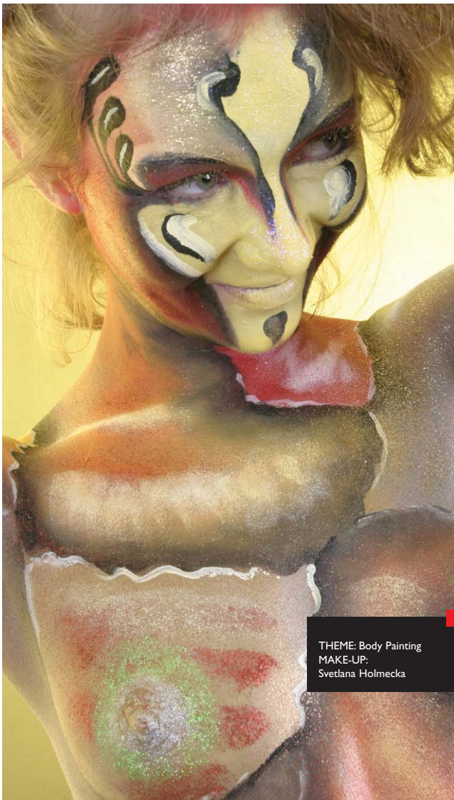
THEME: Body Painting MAKE-UP: Svetlana Holmecka

Come and discover a discipline which reveals exceptional moments of creativity!