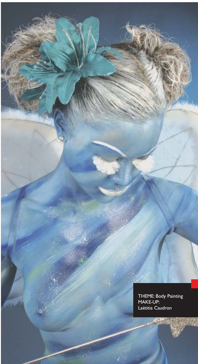
THEME: Body Painting MAKE-UP: Laëtitia Caudron

This discovery training course is designed as an initiation into the world of the make-up artist professional . Taking place during the school holidays, the training course deals the basic principles of make-up: presentation of the sectors of activity and the equipment used, demonstration and practice of the different disciplines (beauty, theatre, fashion, face painting, light special effects...).